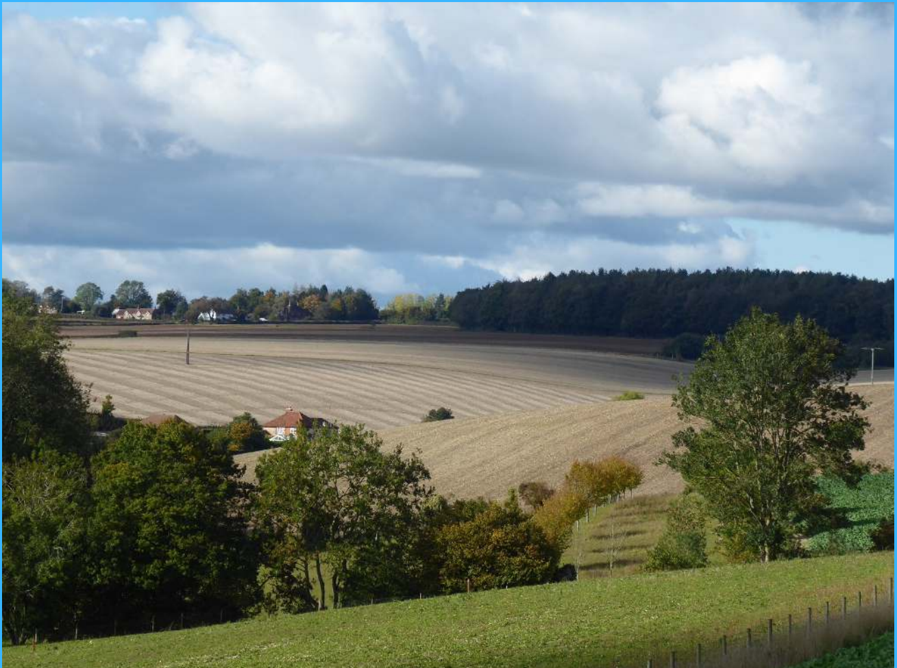
Autumn Landscape near Hambleden