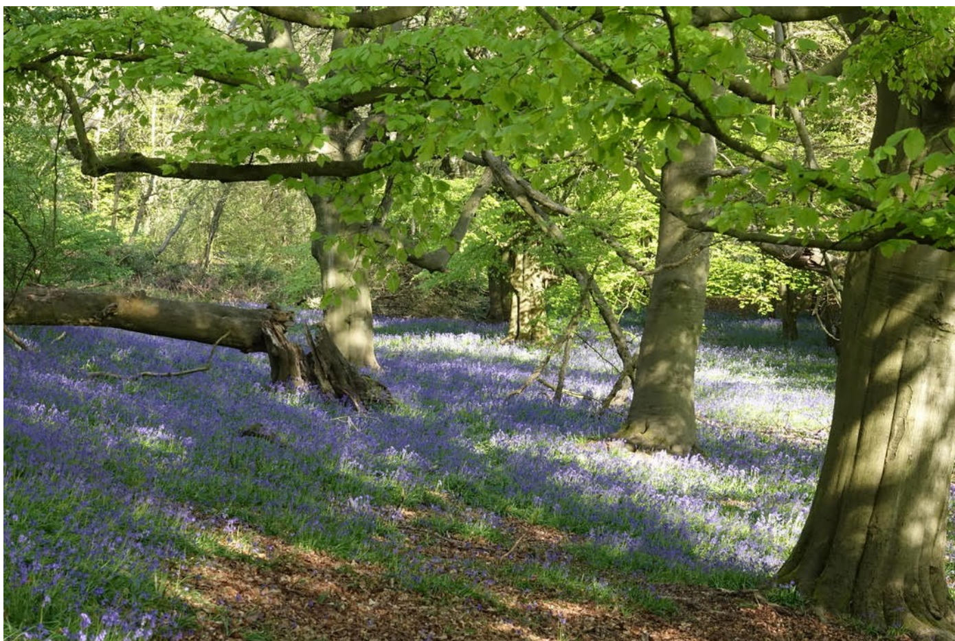
Bluebells in Hodgemoor Woods